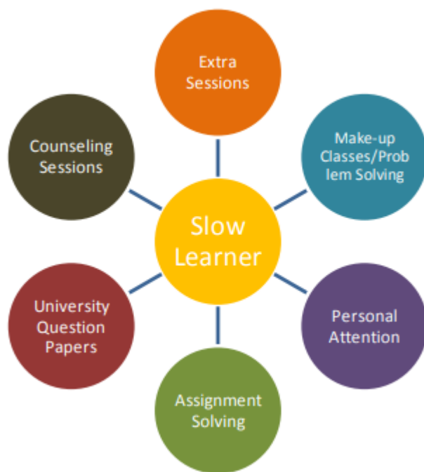
Activities Conducted for Slow Learners